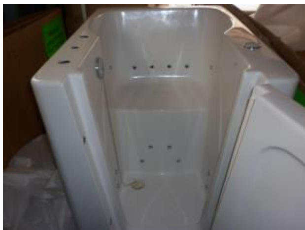
PLACEMENT OF THE HYDROTHERAPY JETS