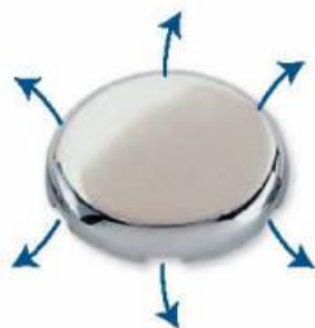
THE HYDROTHERAPY JETS

The image below shows the air jets, you will notice the air comes out of 6 holes around the RIM of the jets. This means the system can deliver very high pressure pulses of air, without drilling holes through you. The control pad in the bath, allows you to control the pressure and the pulse rate to fit your individual needs.