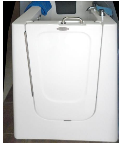
RIGHT HINGE MODEL, DOOR OPENS OUTWARD