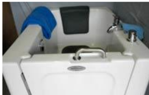
THE HANDLE ON THE DOOR TURNS, AND INSERTS THE DOOR PINS [SHOWN BELOW] INTO THE BATH FRAME