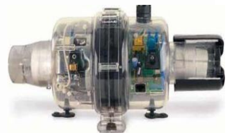
THE HEART OF THE SYSTEM